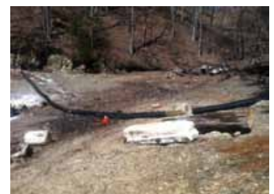
BLA Crew works to replace barriers