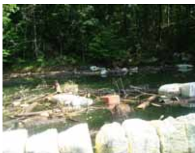
Old styrofoam containment barriers