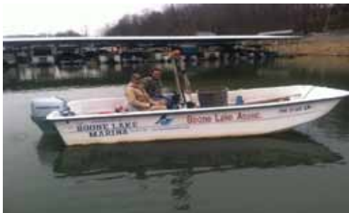
Boat with new 60HP motor