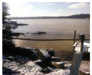
New corrugated pipe barriers

BLA worked this winter to replace the old styrofoam barriers at our containment areas. These barriers are used to contain logs and large debris in designated coves during the summer until the water goes down and the debris can be burned or removed during the winter. The new corrugated pipe barriers are environmentally friendly and are more visually attractive.