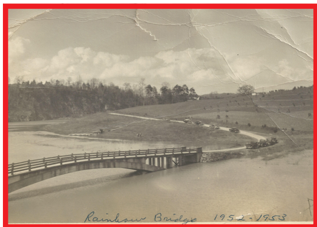
Old Rainbow Bridge, 1952-1953