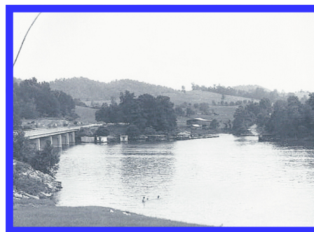
People swimming, with view of new bridge and Crussell Dock