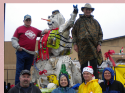
Ready for Johnson City Parade