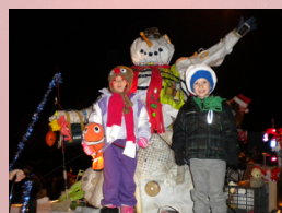
Two young members ready to go in Bristol Parade

Trashy the trashman Hurried to the dumpsters bay But he waved goodbye sayin', Please don't cry The lake will be clean one day!