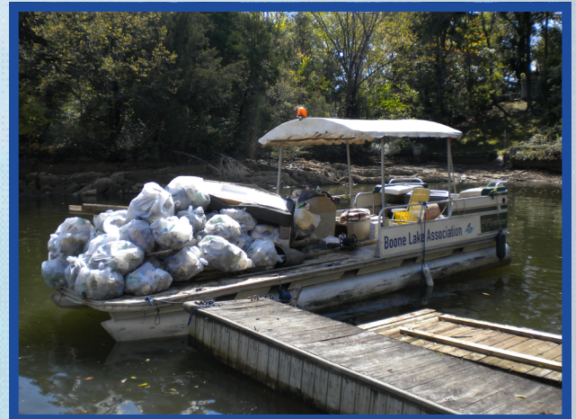
Bags of trash removed from Hodge Island

BLA Lake Operations remains vigilant in "Watching the Waters"!