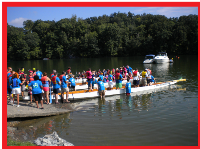
Participants get ready for race

What are the Dragon Boat Races? This event is held annually at the Winged Deer Park sponsored by The Mountain States Health Alliance (MSHA). This year the funds were raised for the Regional Cancer Centers.