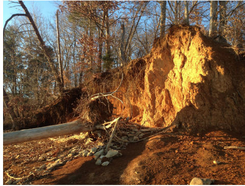
Before work (This is where the 1890's CCC RR bed crossed the river)