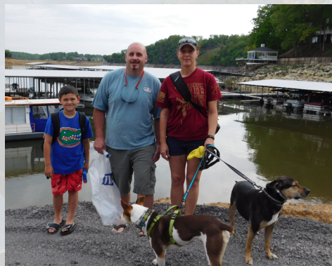
Even the family dogs came out to help with clean up...