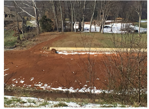
After dirt work and seawall extension