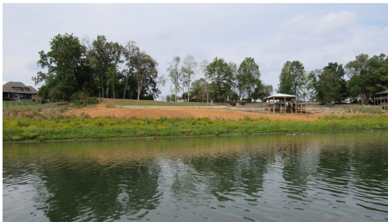
Preparation for seeding