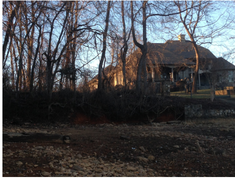
Before bank stabilization work