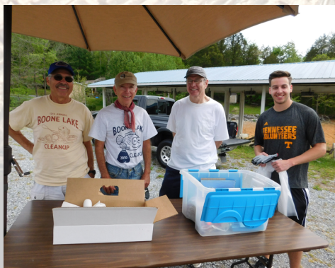
Volunteers hauled in loads of trash at the cove at Sonny's Marina.