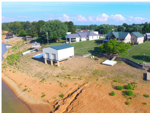
Before restoration of shoreline