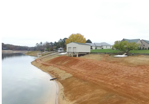
After shoreline restoration