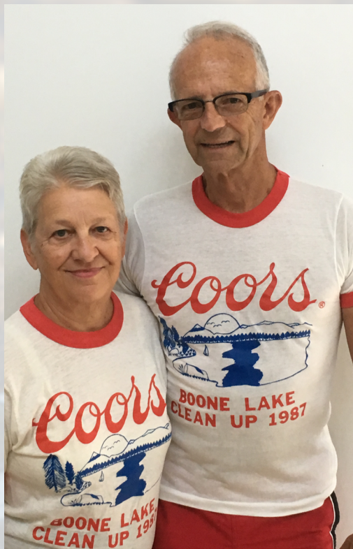
Boone Lake Cleanup Veterans