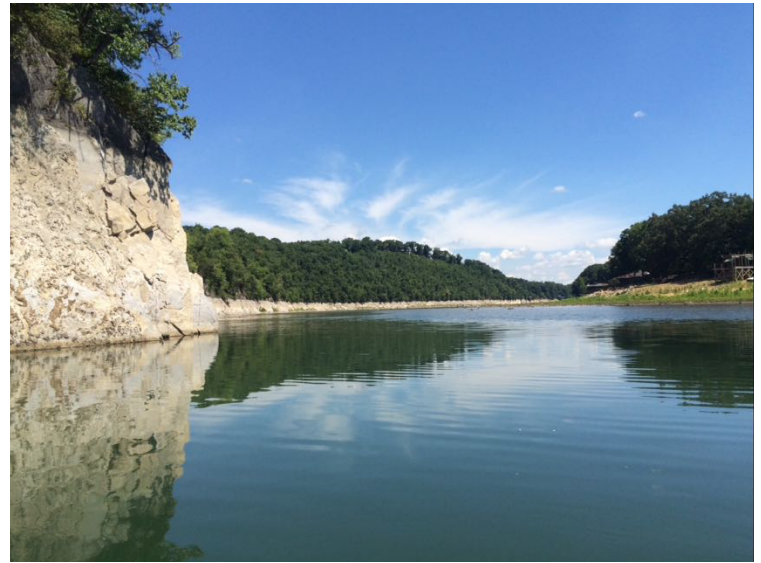
A slick on the Watauga side of the lake.. before and after clean up by the BLA crew

In an effort to conserve money you will not receive a separate dues notice in the mail. Please use the membership form on the reverse to remit your dues....and then recruit a friend or neighbor to join also!