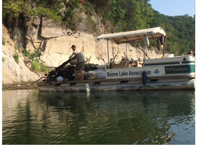
BLA crew at work

Have you given any thought to what our lake would look like if there was no Boone Lake Association? The BLA employs three crew members who work five days a week, year round, removing trash and debris that litters the shoreline and the lake. We are the only organization that cleans the lake! If we are to continue this worthwhile and necessary endeavor we need your help. Not only are we asking that you renew your membership, but we have included an extra membership form for you to share with a friend or neighbor. According to county records there are over 2,000 lake front properties in Washington and Sullivan Counties, and at least as many in lake communities with lake access. In addition there are people from the area that use the lake for recreation. That's over 4,000 potential BLA members; yet in 2016 we had only 321!! Our highest membership on record is just over 630 in 2013 still a far cry from the 4,000 potential members.