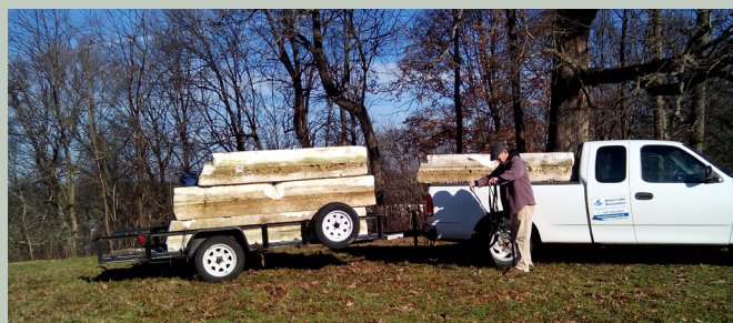
One of 16 loads of Styrofoam!

If you have any Styrofoam to dispose of, please call 423-956-6615 or Aaron at 423-956-8727. Our crew will be happy to coordinate its disposal.