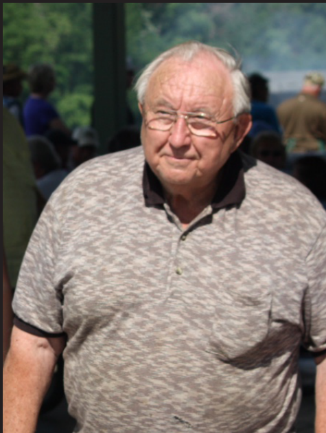
March 29, 1928 – December 2, 2018

Key take-aways from the event were that the Boone Dam Repair Project is generally on time, on budget, and thus far, no major obstacles have been encountered. TVA was firm that the Lake would return to full pool for the Summer, 2022 season, and likely some filling (and testing) can be expected during late 2021.