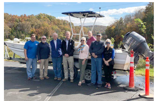
Members of the BLA Board accepting donated skiff boat.

BLA will use the boat now to transport crew to our "garbage barges" and return with trash accumulated on those barges. The trash gets brought to shore and deposited in dumpsters provided by local municipalities. In the future, we hope to acquire at least one Trash Skimmer and the skiff will be used as a support vessel for