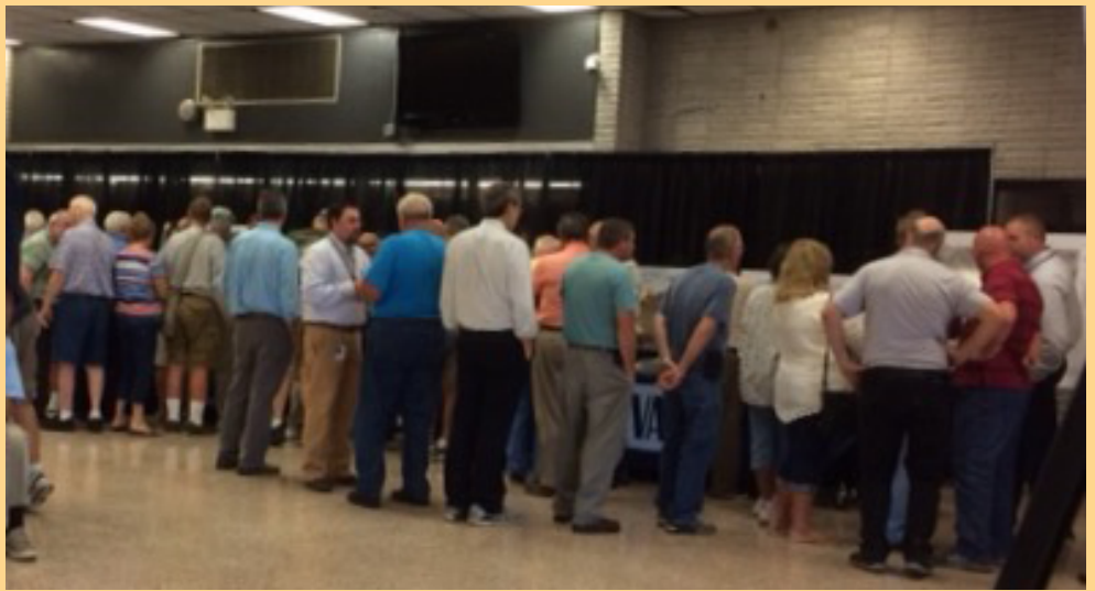
Some of the crowd at TVA's information Fair

More than 200 people were at the doors when they opened promptly at 5:30 pm. TVA had organized the room into "tables" staffed by the many stakeholders of the Boone Dam Repair Project. From the Treviicos-Nicholson Joint Venture (awarded the massive contract to build the 'curtain wall' inside the earthen portion of the Dam) to the Safety Team to Construction Management to your own Boone Lake Association, every aspect of the Project had resources on hand to provide updates and answer questions.