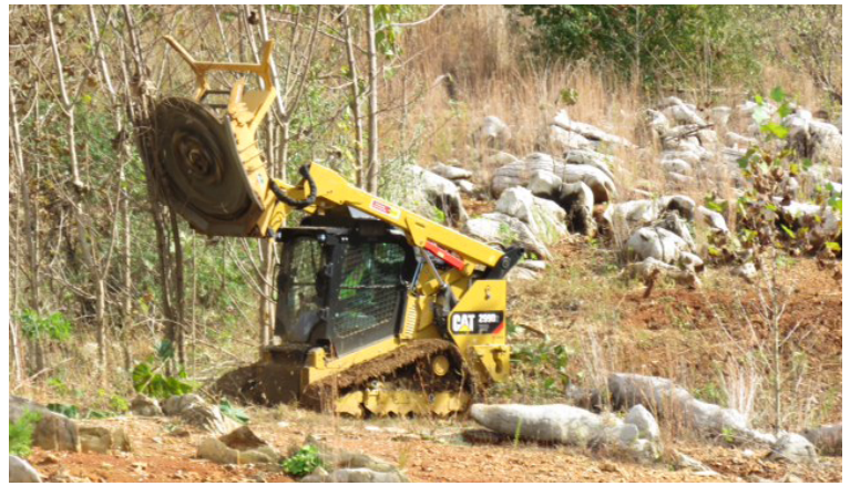
One of the two skid steers in action, clearing vegetation.

The Boone Lake Association is working closely with TVA and our current plan is to spring into action behind TVA as the water level rises. We believe there will be substantial accumulation of ground material as well as the re-floating of accumulated logs, branches, old docks, trash and garbage which has found a temporary home in the vegetation while